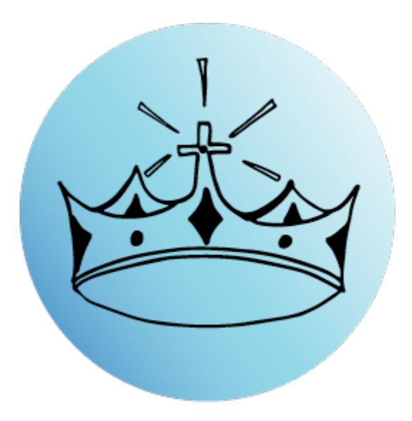
Day 6, December 22: O King of the Nations

O God of all, joy of every human heart; O Keystone of the mighty arch of humanity: Come and unite your people whom you fashioned in all the earth.