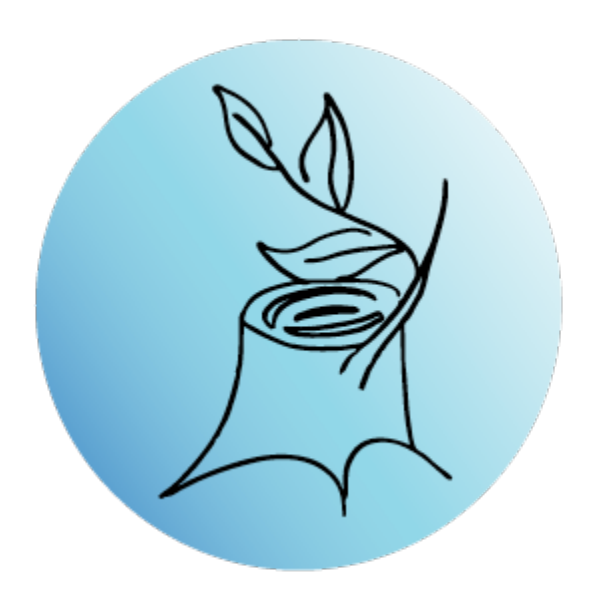
Day 3, December 19: O Root of Jesse

O Root of Jesse, you are raised up as a sign for all peoples; leaders can only stand silent in your presence; your people lift their hearts in worship before you. Come to us, Living Hope.