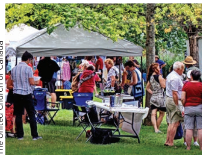
The United Church of Canada