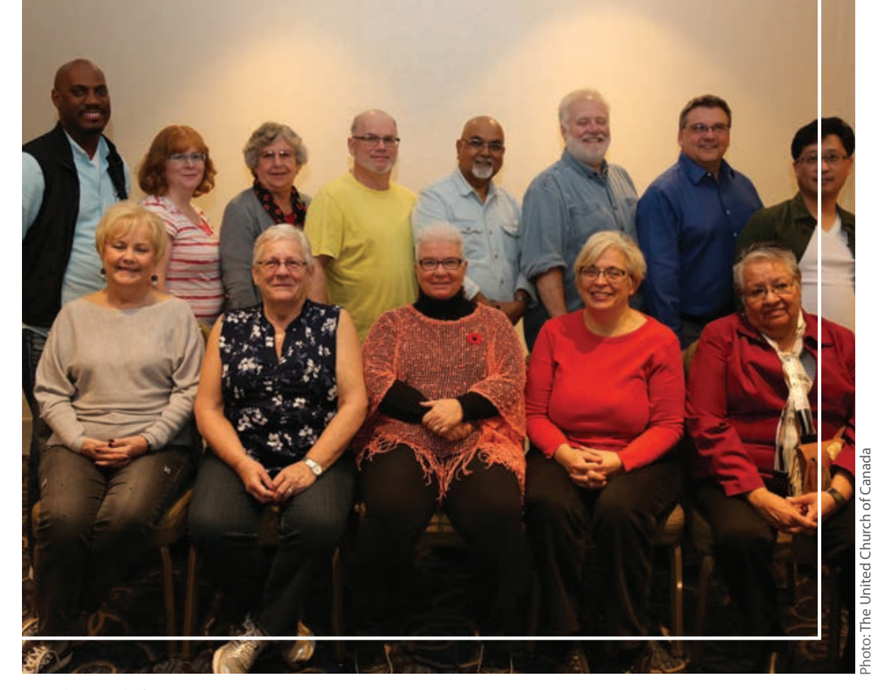
The Board of Vocation