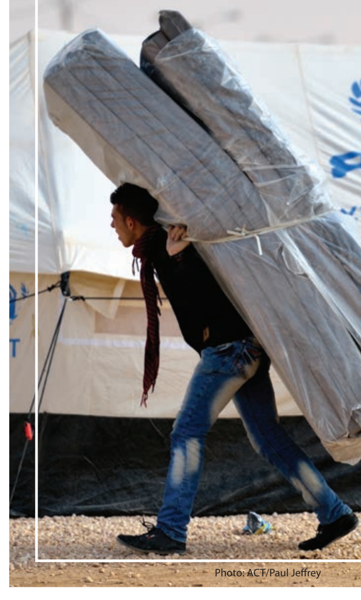
Zaatari Refugee Camp, Jordan

There has been a marked increase in the number of congregations wanting to sponsor, particularly since 2015 with the global awareness of the Syrian Crisis of fleeing refugees. Afghans, Syrians, Pakistanis, Yemenis, Iraqis, Congolese, Eritreans in Israel, Rohingya, and LGBTQIA+ and Two Spirit people continue to be refugee populations of concern. We encourage more congregations to sponsor LGBTQIA2S+ refugees, who are one of the most marginalized and persecuted groups, either through the specific program for this group or through the government-referred program (Blended Visa Office Referred).