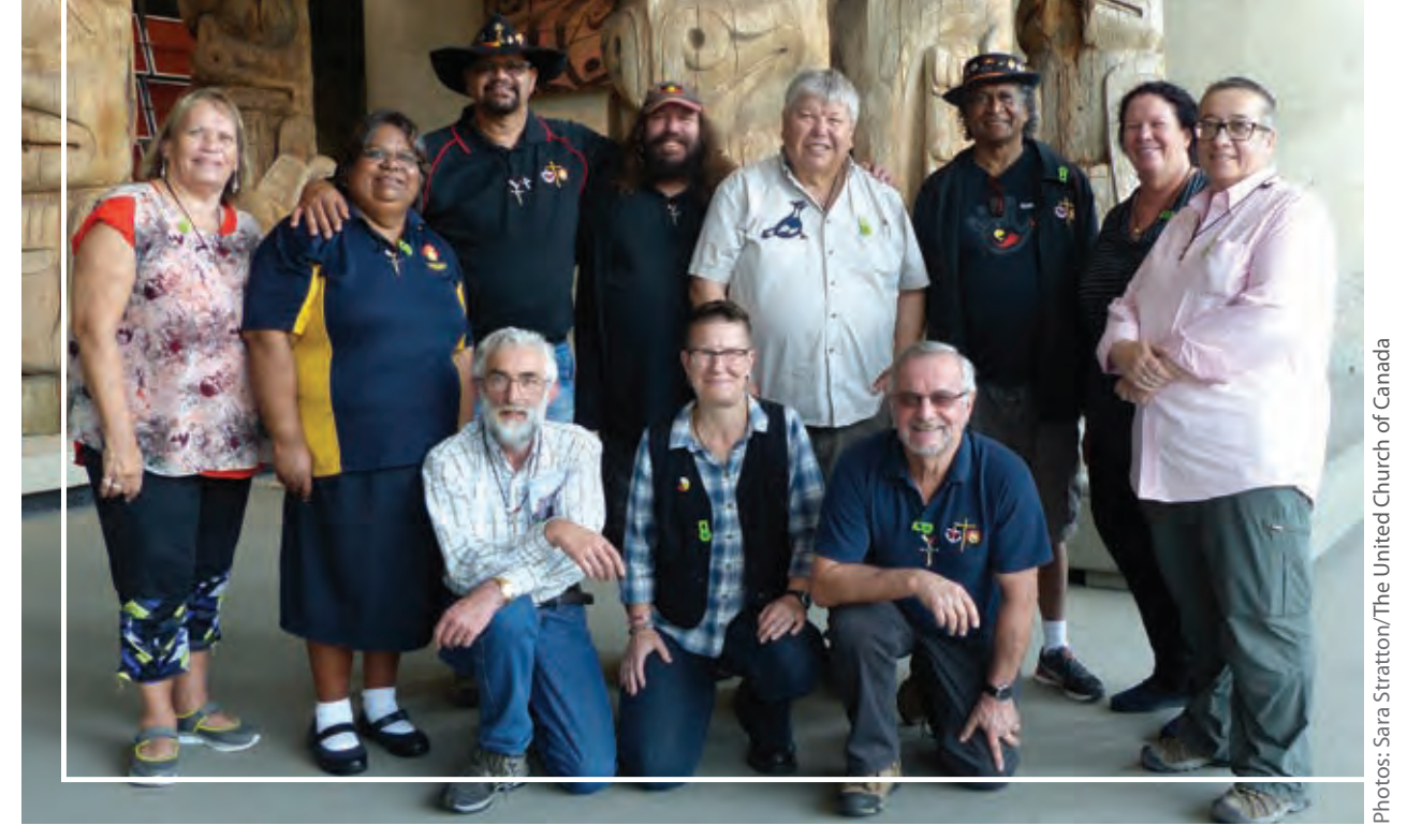
Canada-Australia Reconciliation Dialogue delegation.