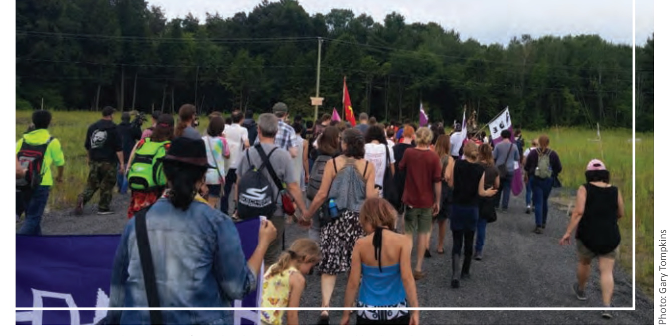
Protestors show support for Mohawk people over disputed lands in Oka, Quebec.