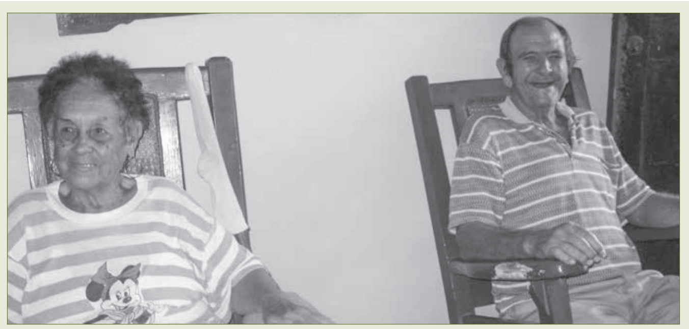
The Christian Centre for Reflection & Dialogue in Cuba creates opportunities for food security and education.

In the Caribbean and Latin America, the United Church works with Mission & Service partners to secure community access to food and sustainable practices, to provide education for young children and adults, and to build and sustain safe water supplies. Partners also work to promote respect for human rights, including women's and Indigenous peoples' rights, as well as the right to a healthy environment in the context of resource extraction projects, such as mining. The United Church also supports Mission & Service partner work responding to humanitarian crises and, with others, advocates for strong development and aid policies that support people and communities in crisis.