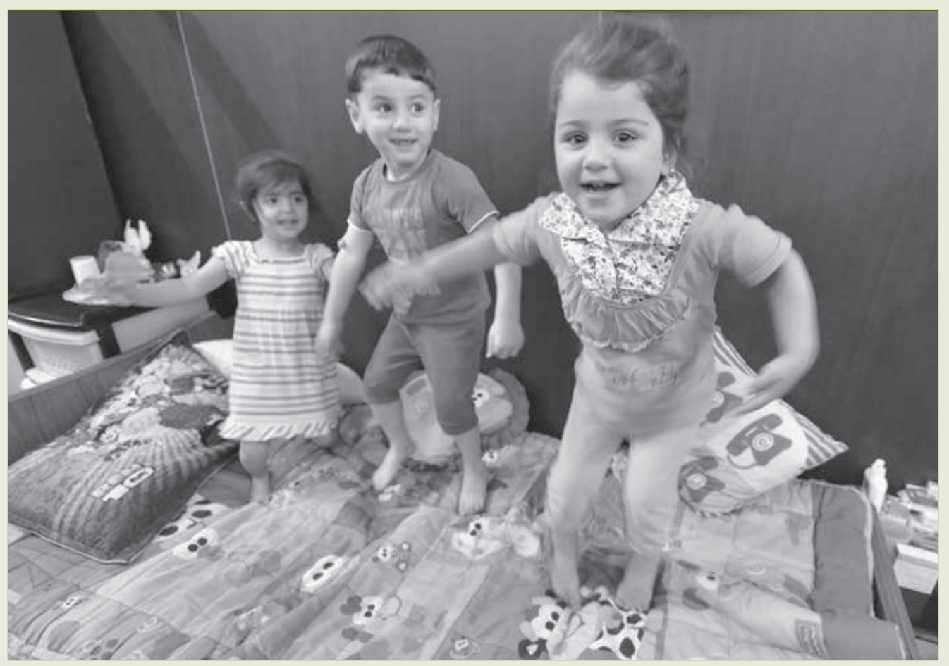
Palestinian children at a Middle East Council of Churches Day Care Centre in Jordan. The Middle East Council of Churches works with displaced Palestinians, offering employment and education help.

In Africa and the Middle East, the United Church works with Mission & Service partners on urgent issues affecting people's daily lives. Priorities are sustainable livelihoods, community access to food and markets, and the right of communities to determine what food to grow locally and how, as well as access to land and safe water in the context of land grabbing, issues of resource extraction, such as mining, and working for justice and peace.