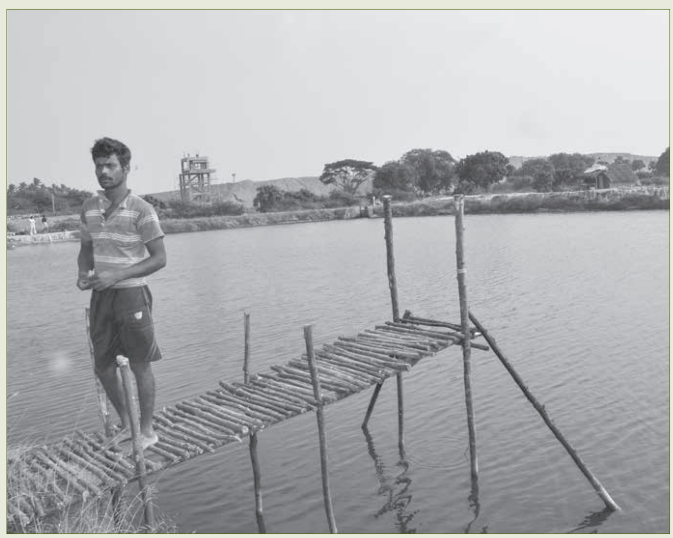
A shrimp fisherman in Tamil Nadu, India, with the Human Rights Advocacy and Research Foundation advocates for those who are poor and disabled.