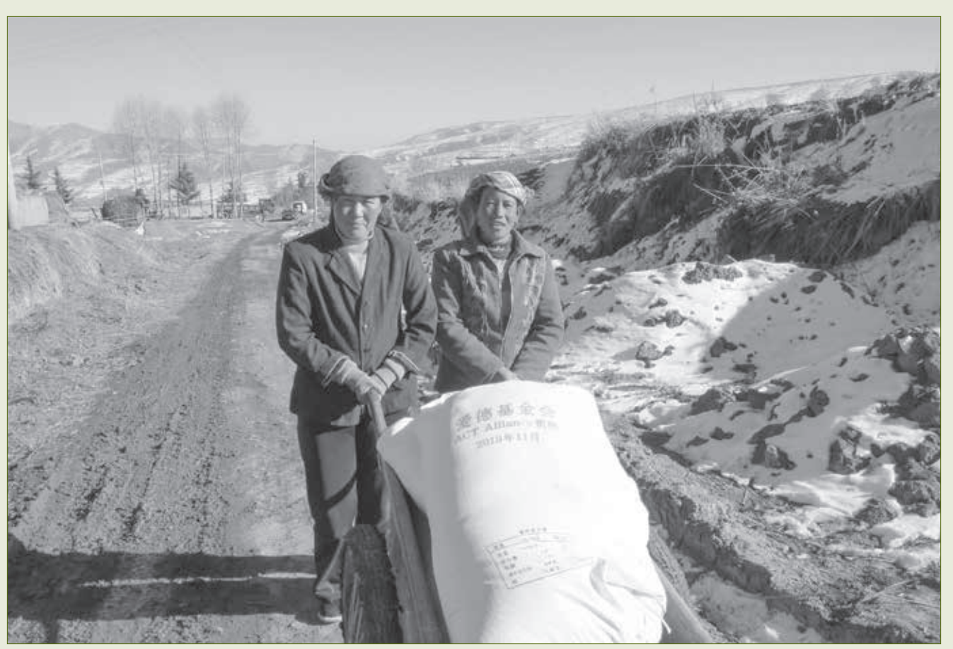
Women receive food aid in a remote community in China. Amity Foundation offers a wide variety of programs in order to support those on the country's margins.

In Asia, the United Church works with Mission & Service partners who are identifying and addressing human rights abuses wherever they occur, as part of building a world of justice for all. Critical issues for the region include peace building and upholding the rights of communities to healthy environments in the context of resource extraction projects, such as mining. The work of Mission & Service partners includes sustainable community development and addressing food security. The United Church also supports Mission & Service partners responding to humanitarian crises.