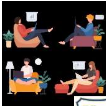
Royalty Free Image: Meet Virtually

You are important to us, so be sure to reach out to be included! If, as a UCW woman, you are living your purpose in your community of faith, but no longer have access to an active UCW Unit, reach out, sign up, and be counted!